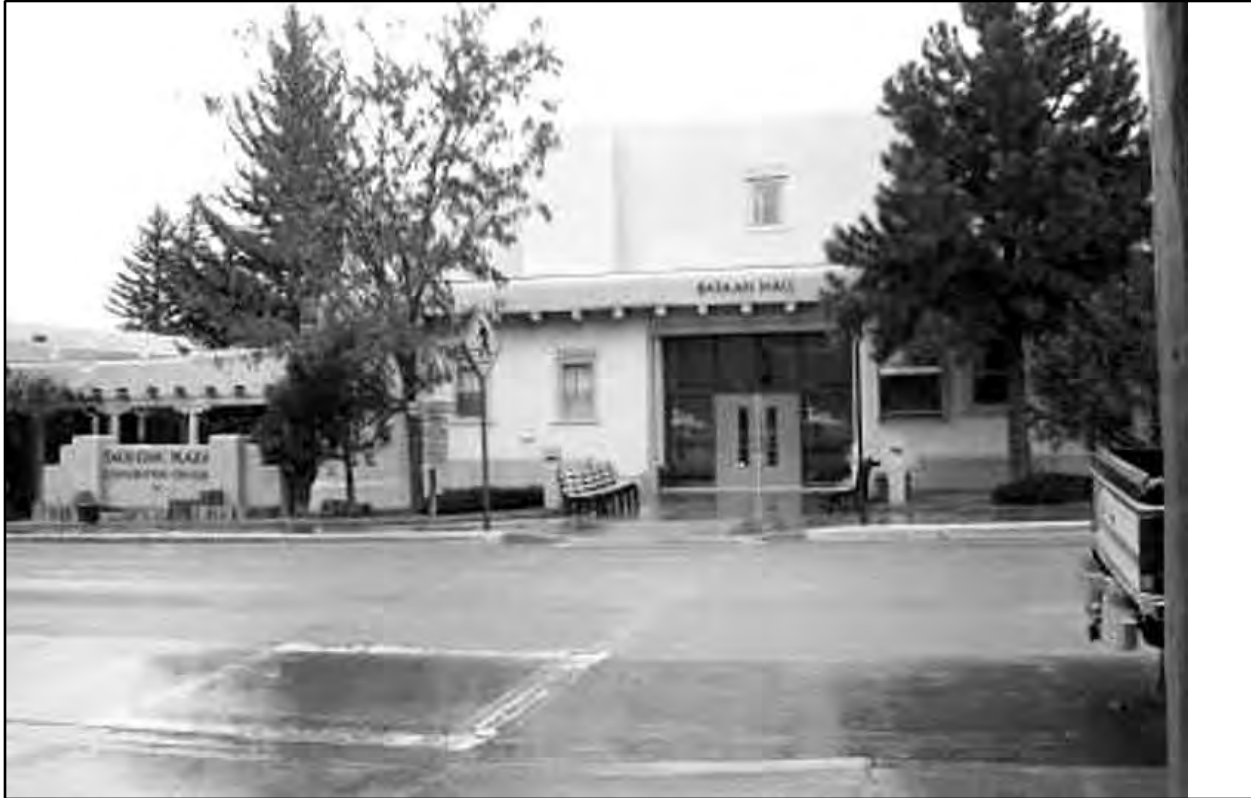
NOTES ON ADDITIONAL PERSPECTIVE: south elevation of west wing (If photo, include photo info, as in #10)

ADDITIONAL PERSPECTIVE: (Photo, drawing, footprint, etc.; indicate north arrow when possible)