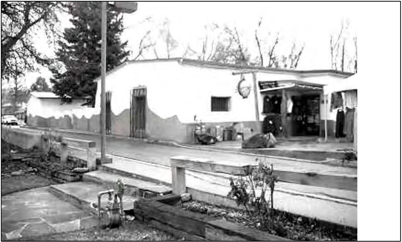
2005 Survey Photo 3