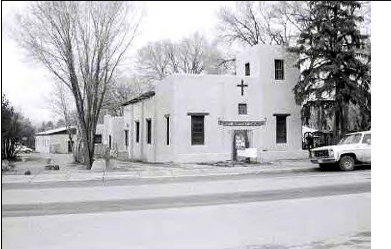
NOTES ON ADDITIONAL PERSPECTIVE: east and south elevations (If photo, include photo info, as in #10)

ADDITIONAL PERSPECTIVE: (Photo, drawing, footprint, etc.; indicate north arrow when possible)