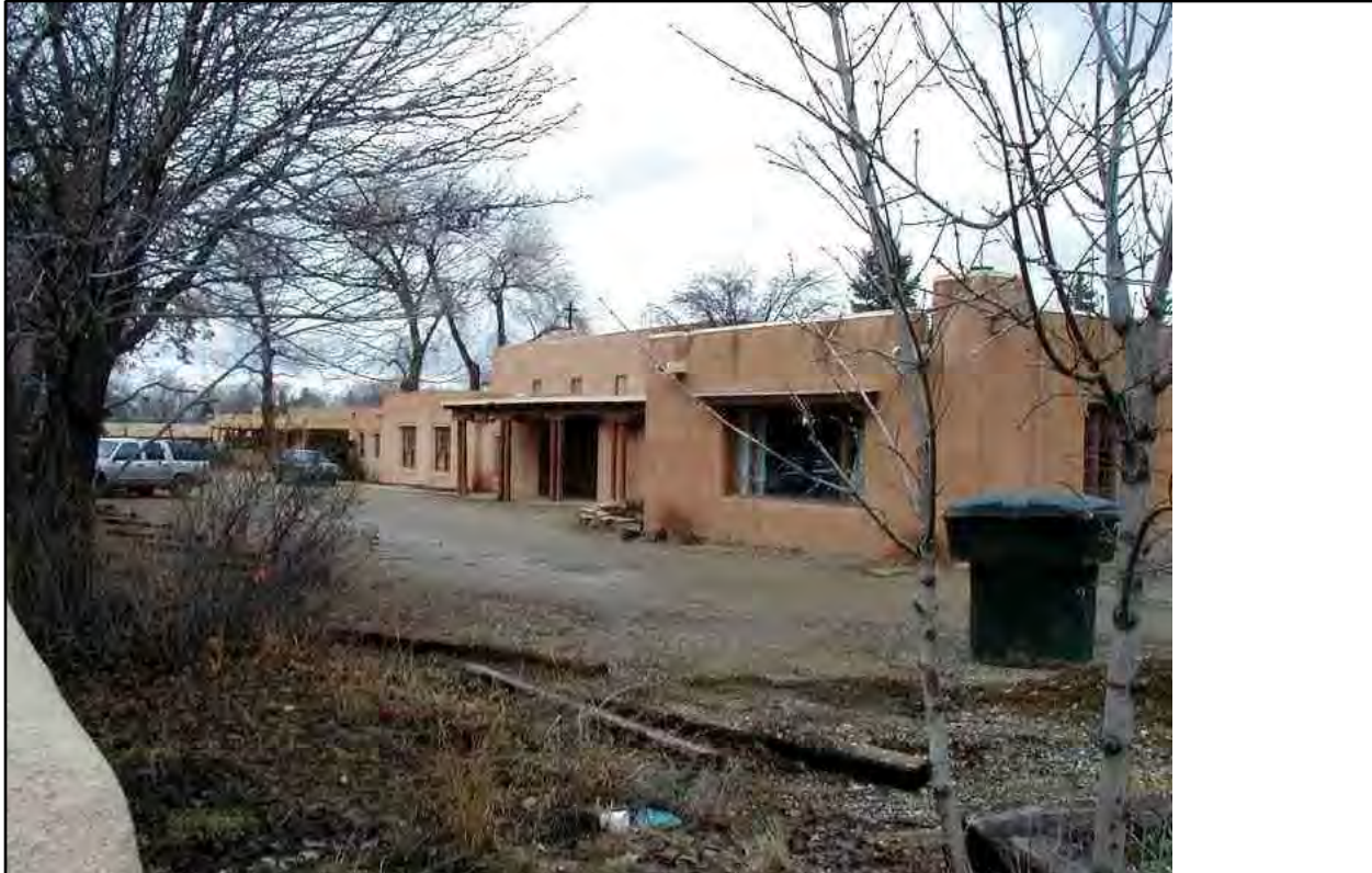
NOTES ON ADDITIONAL PERSPECTIVE: south elevation of post-1957 addition (If photo, include photo info, as in #10)

ADDITIONAL PERSPECTIVE: (Photo, drawing, footprint, etc.; indicate north arrow when possible)