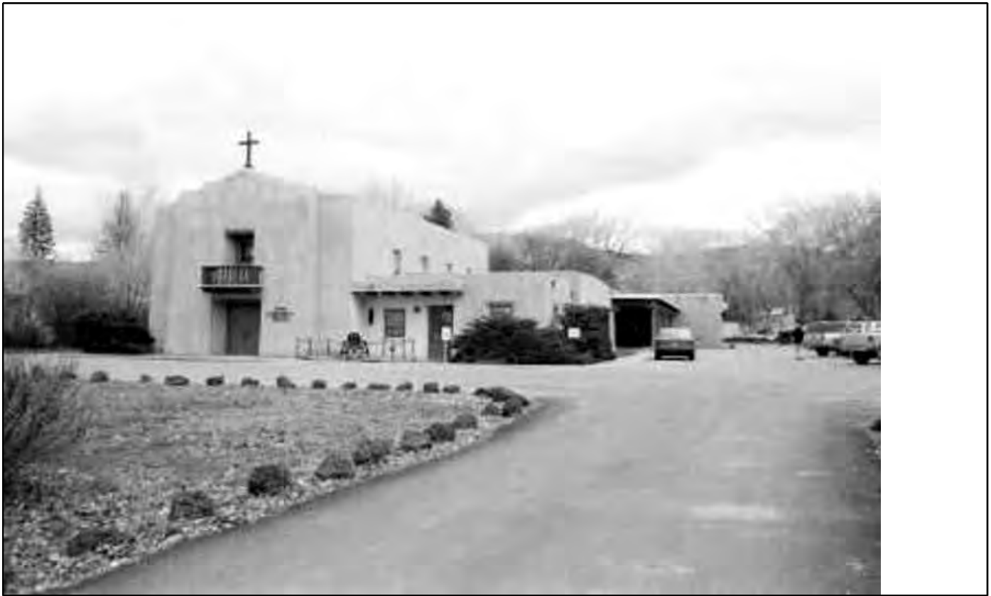
2005 Survey Photo 3