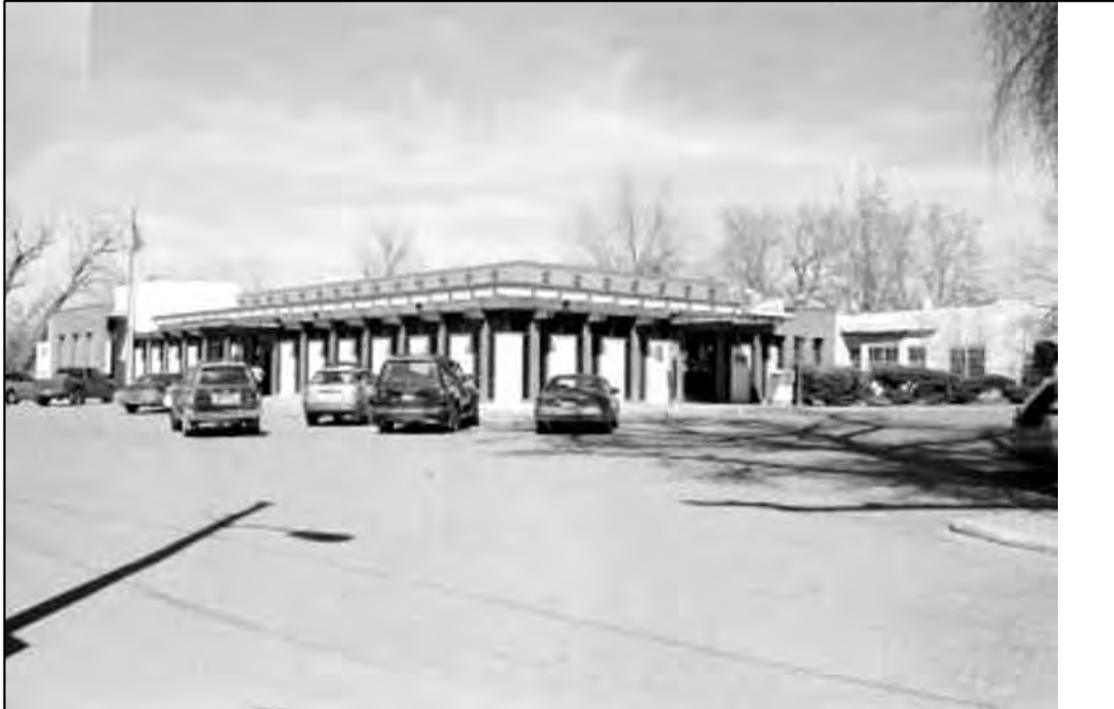
NOTES ON ADDITIONAL PERSPECTIVE: east and south elevations (If photo, include photo info, as in #10)

ADDITIONAL PERSPECTIVE: (Photo, drawing, footprint, etc.; indicate north arrow when possible)