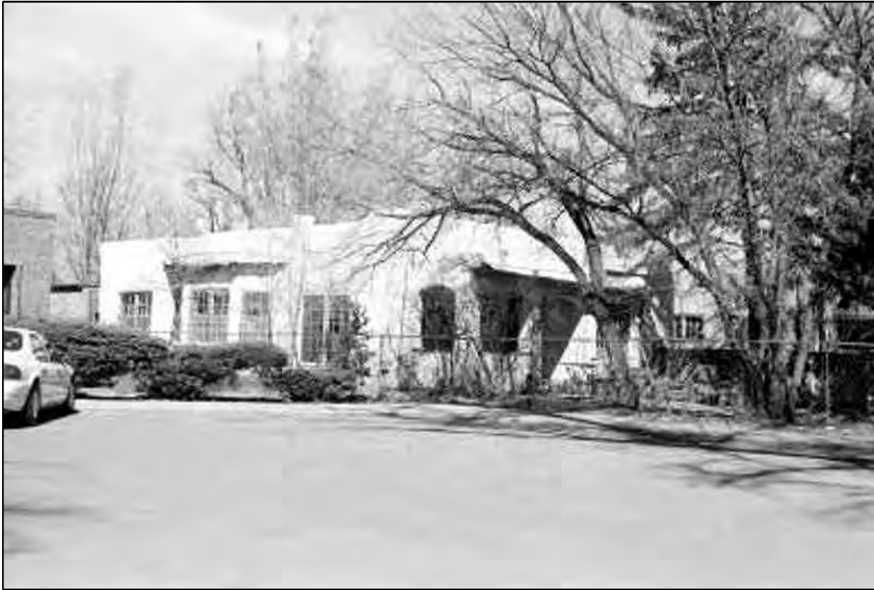
2005 Survey Photo 3