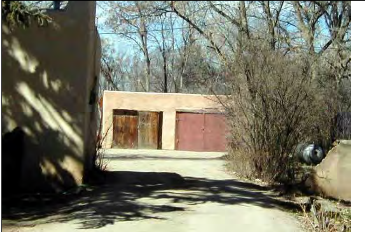
NOTES ON ADDITIONAL PERSPECTIVE: east elevation of garage (If photo, include photo info, as in #10)

ADDITIONAL PERSPECTIVE: (Photo, drawing, footprint, etc.; indicate north arrow when possible)