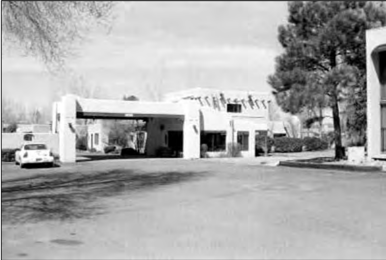
2005 Survey Photo 3

IF SO, ARE THEY ELIGIBLE FOR LISTING?: None