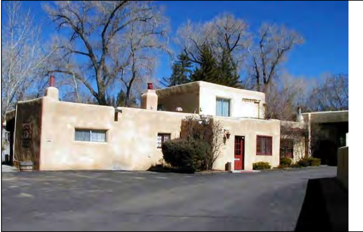
NOTES ON ADDITIONAL PERSPECTIVE: south elevation at west end (If photo, include photo info, as in #10)

ADDITIONAL PERSPECTIVE: (Photo, drawing, footprint, etc.; indicate north arrow when possible)