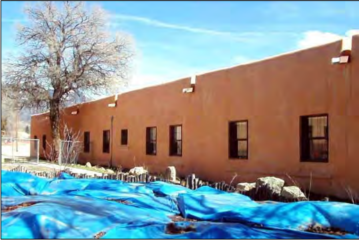
2005 Survey Photo 3