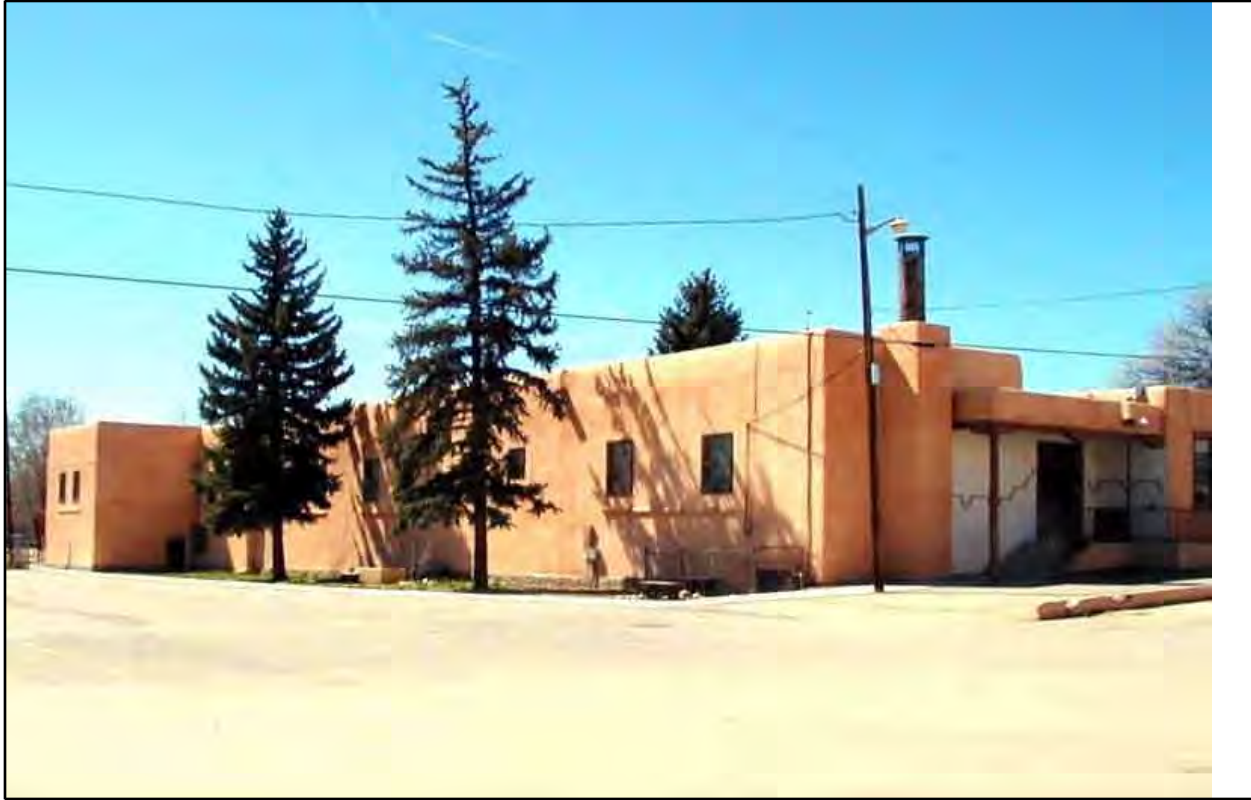
NOTES ON ADDITIONAL PERSPECTIVE: east elevation (If photo, include photo info, as in #10)

ADDITIONAL PERSPECTIVE: (Photo, drawing, footprint, etc.; indicate north arrow when possible)