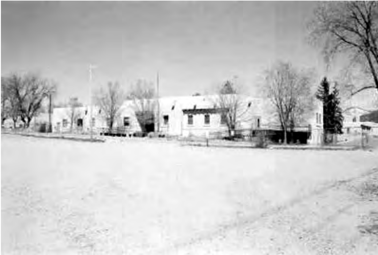
2005 Survey Photo 4