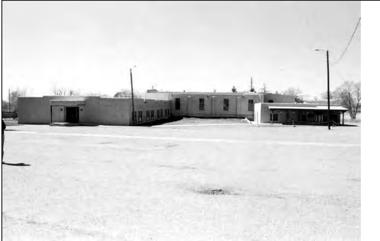
NOTES ON ADDITIONAL PERSPECTIVE: Roll 2, Frame 29. East elevation. (If photo, include photo info, as in #10)

ADDITIONAL PERSPECTIVE: (Photo, drawing, footprint, etc.; indicate north arrow when possible)