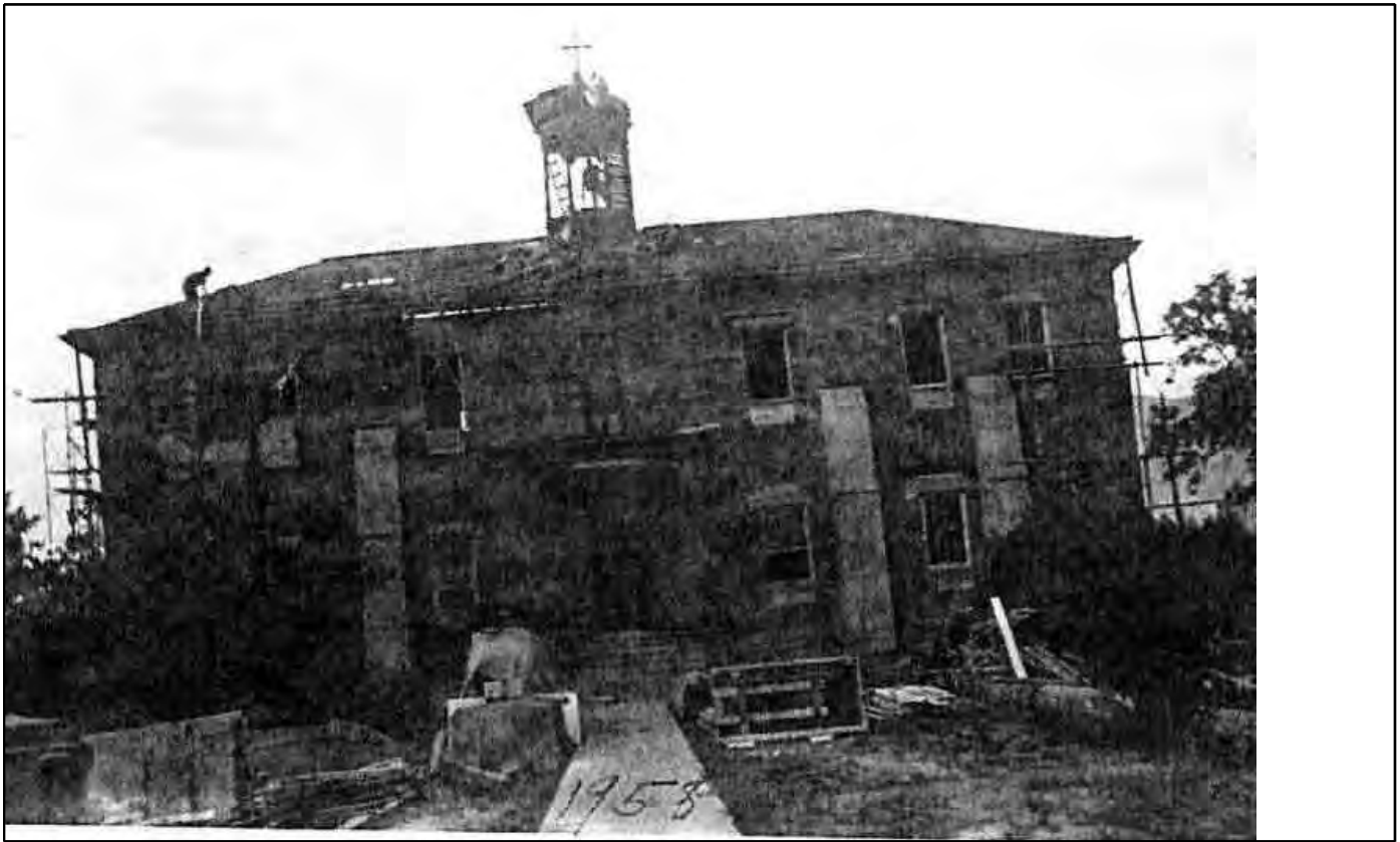
2005 Survey Photo 3