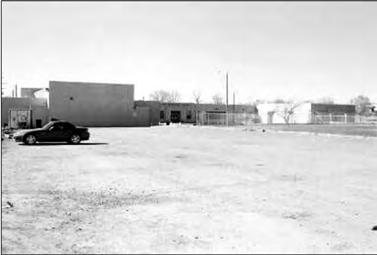
2005 Survey Photo 3