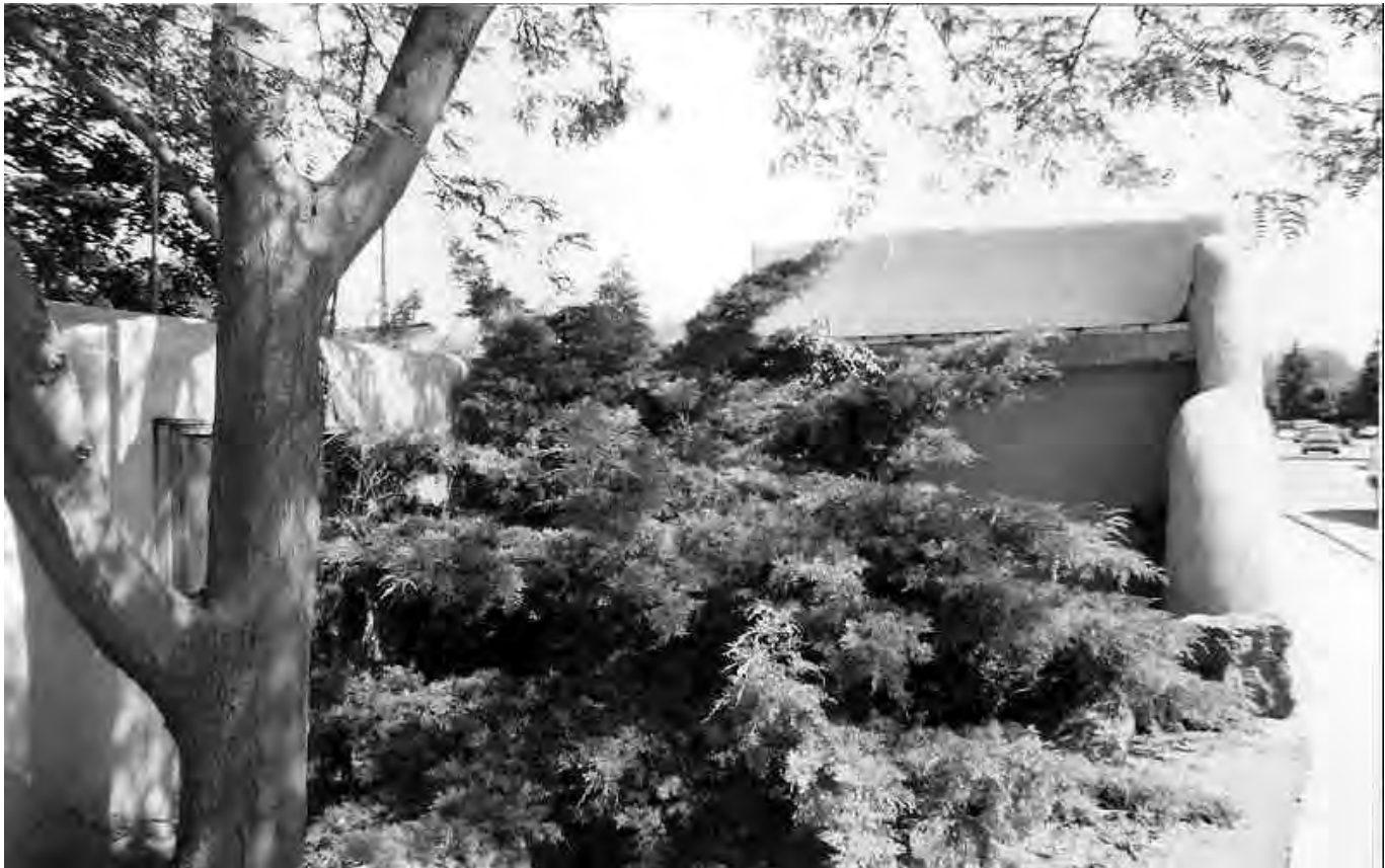
1996 Survey Photo 4