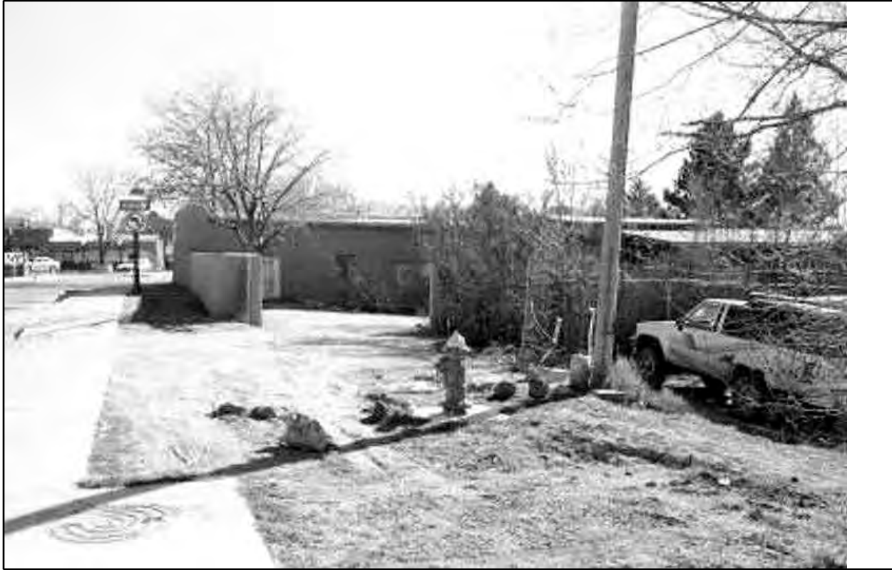
NOTES ON ADDITIONAL PERSPECTIVE: roll 2, frame 33, north elevation (If photo, include photo info, as in #10)

ADDITIONAL PERSPECTIVE: (Photo, drawing, footprint, etc.; indicate north arrow when possible)