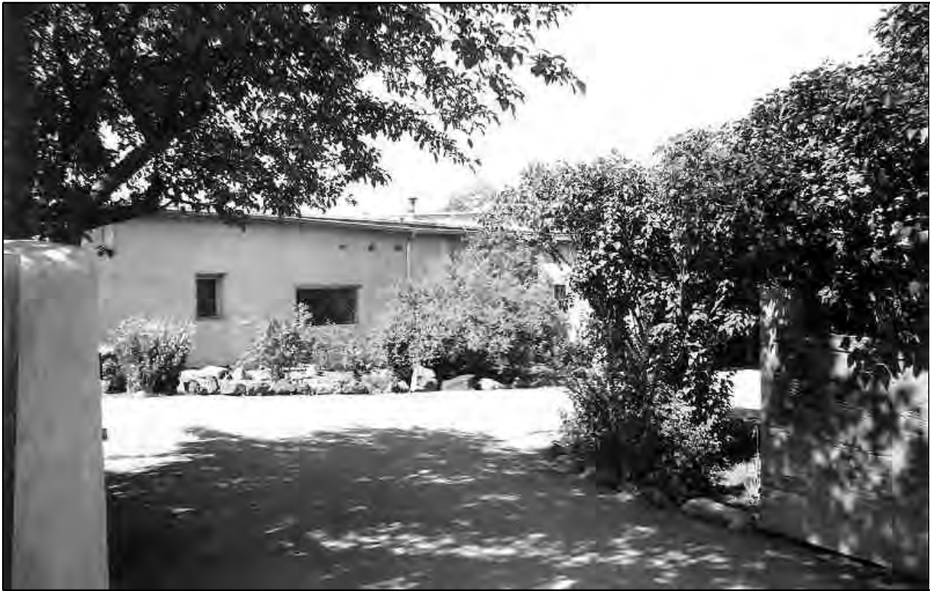
1996 Survey Photo 3