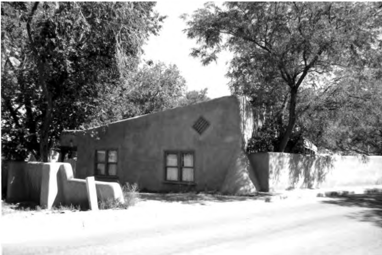
1996 Survey Photo 4