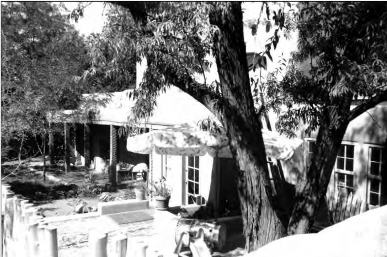
1996 Survey Photo 3