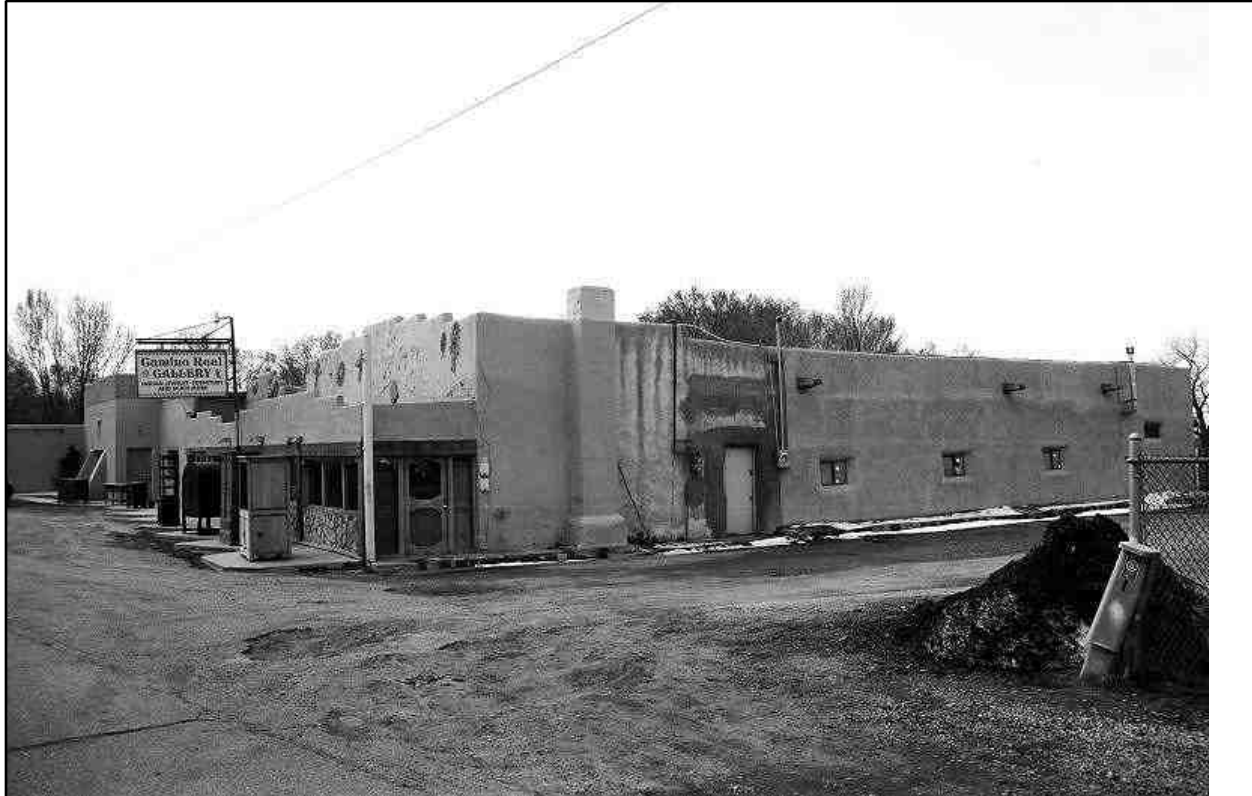
NOTES ON ADDITIONAL PERSPECTIVE: Roll 5, frame 3A-N elevation (If photo, include photo info, as in #10)

ADDITIONAL PERSPECTIVE: (Photo, drawing, footprint, etc.; indicate north arrow when possible)