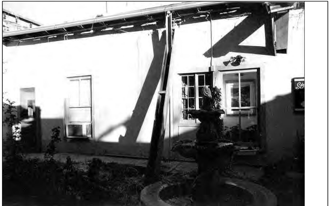
1996 Survey Photo 8