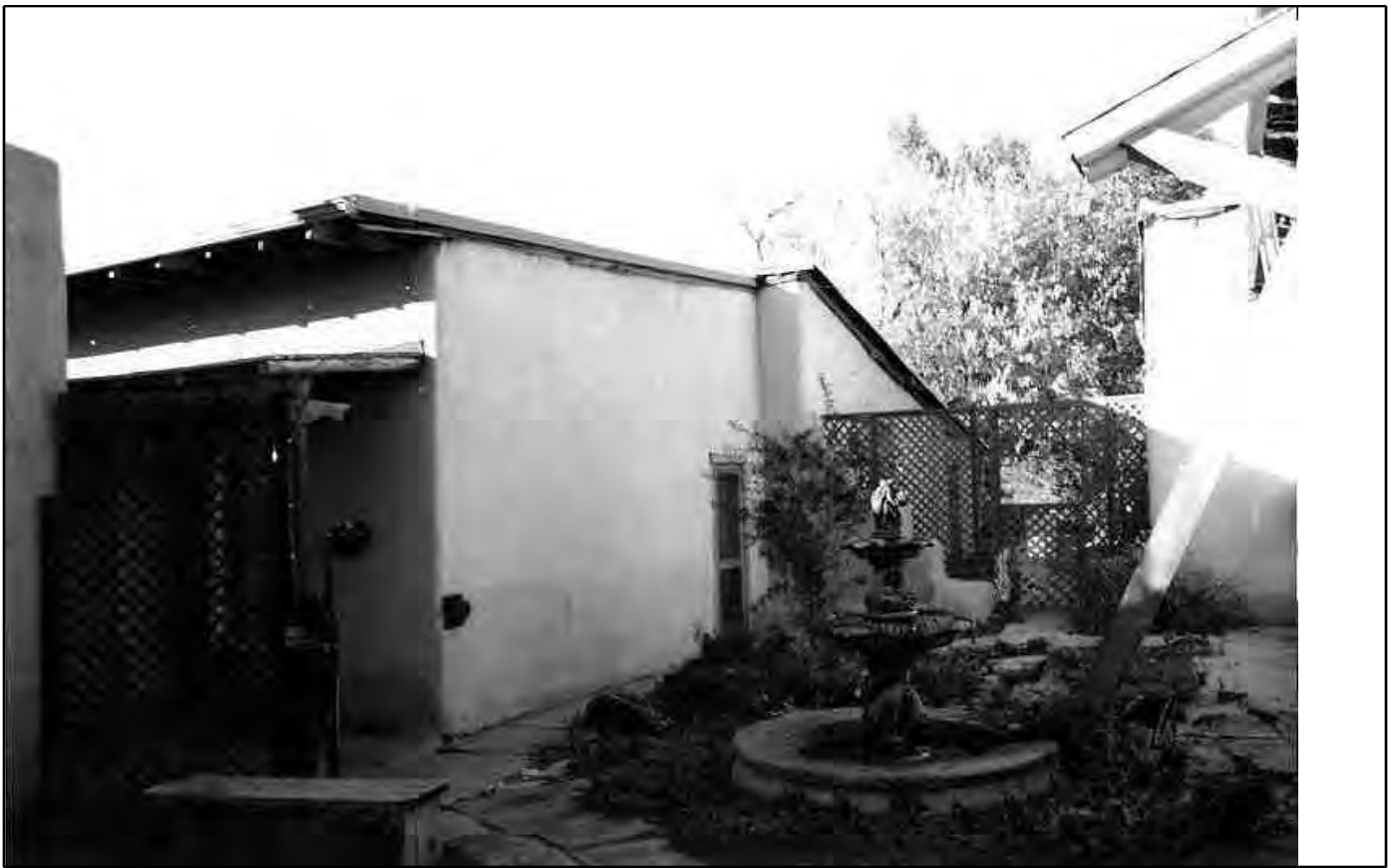
1996 Survey Photo 7