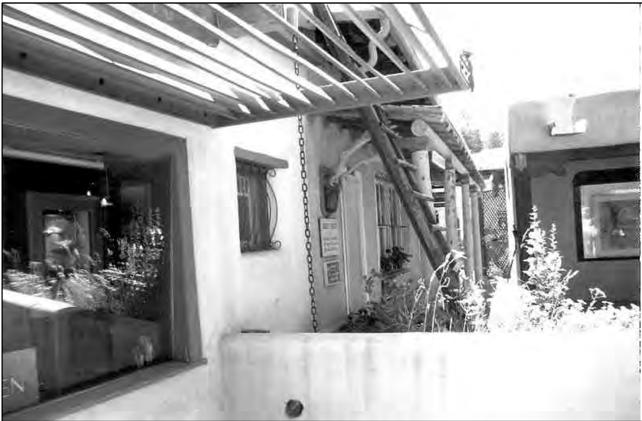
1996 Survey Photo 3