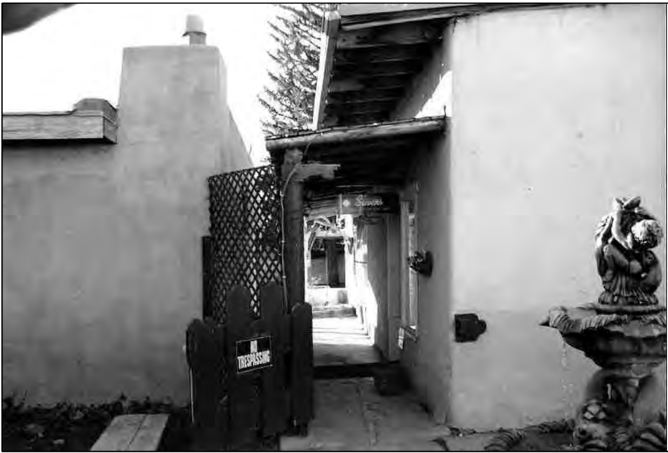
1996 Survey Photo 9