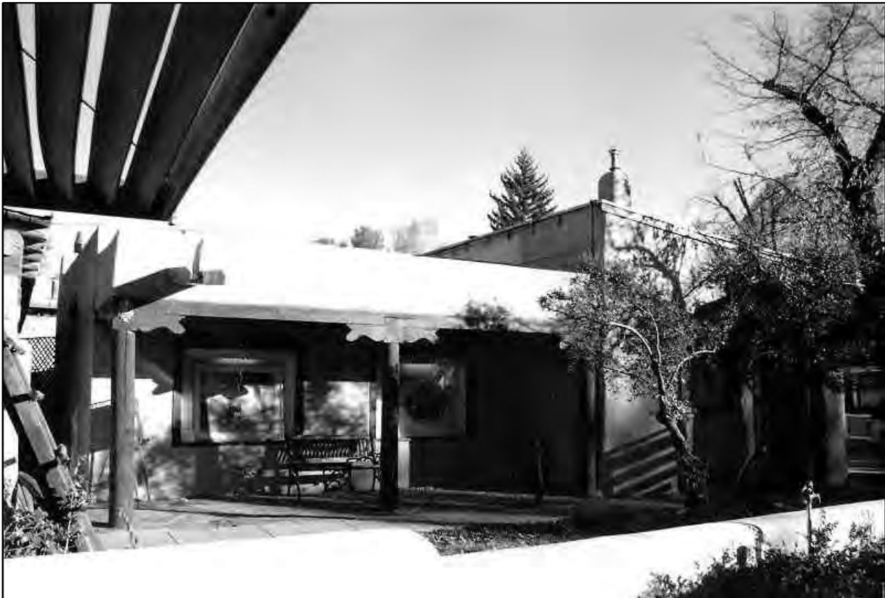
1996 Survey Photo 10