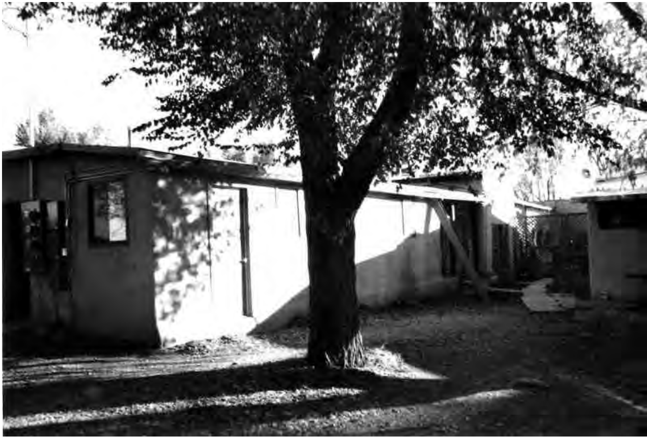
1996 Survey Photo 5