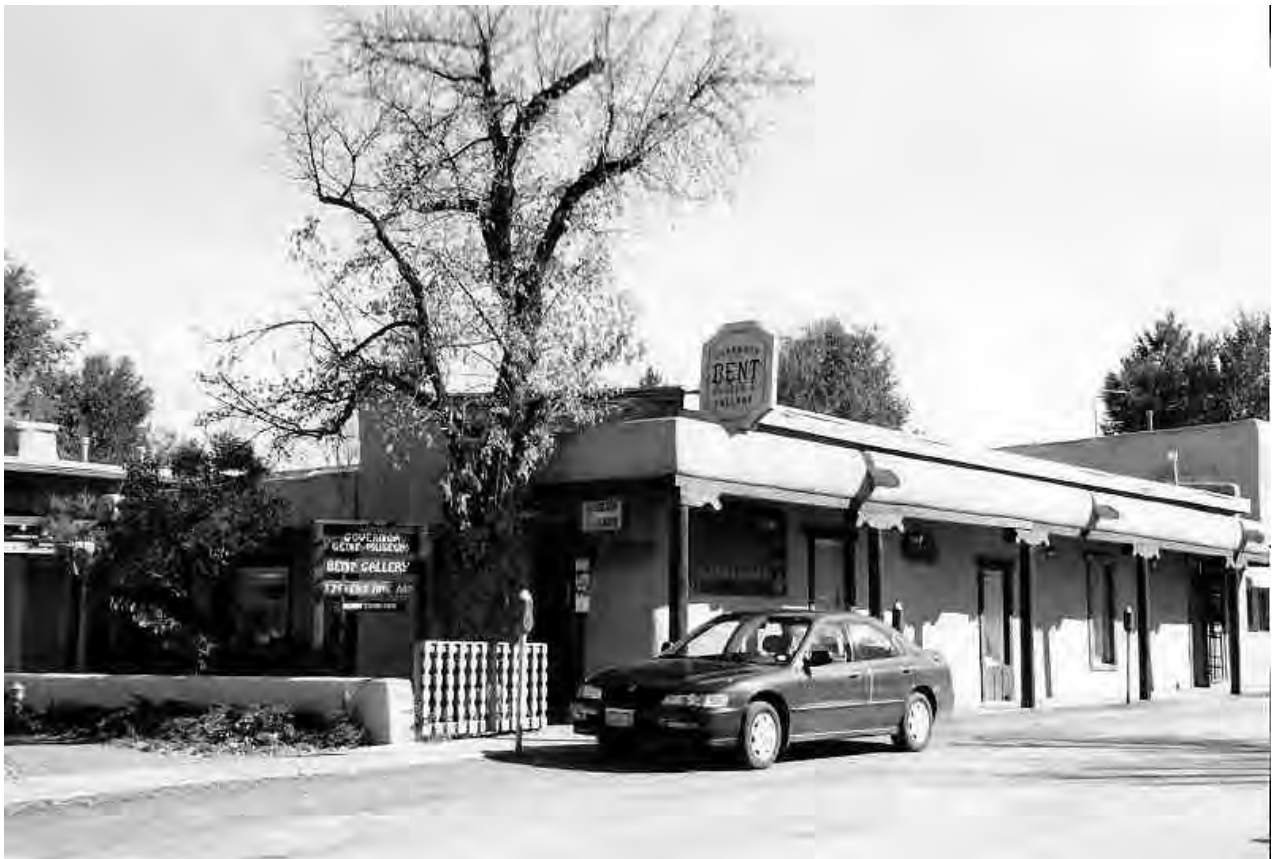
1996 Survey Photo 4