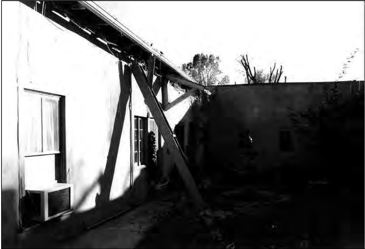
1996 Survey Photo 6