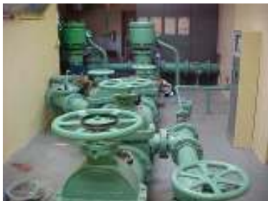
Booster Station, Taos, NM

Last year, as in years past, your tap water met all U.S. Environmental Protection Agency (EPA) and state drinking water health standards. The Town of Taos safeguards its water supplies and once again we are proud to report that our system has never violated a maximum contaminant level or any other water quality standard. This report is a snapshot of last year's water quality. Included are details about where your water comes from, what it contains, and how it compares to standards set by regulatory agencies. We are committed to providing you this information because informed customers are our best allies.